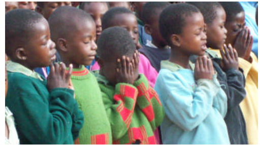
Children at Muziti have devotions weekdays during the morning assembly. "Thank you God for being who you are"

The first stage of the Muziti water well was successfully completed! Praise God! The well was constructed and it was dedicated on 8th June 2011 at Muziti, Zimbabwe. The next stage is to build a water reservoir that will store enough water for the use of the church, the school, and the Muziti mission Centre and village community. Please send donations to Trinity UMC marked "Zimbabwe water project."