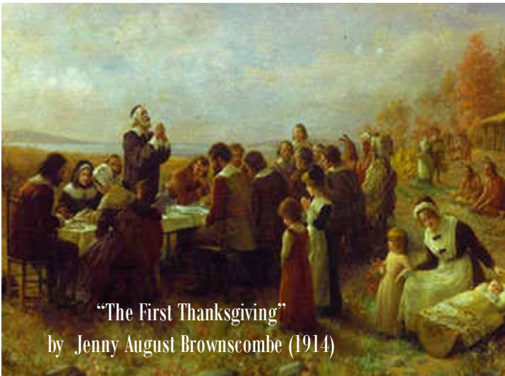
"The First Thanksgiving"

6800 Wurzbach Road San Antonio TX 78240 210-684-0261