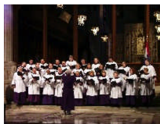
Children to Sing on Palm Sunday